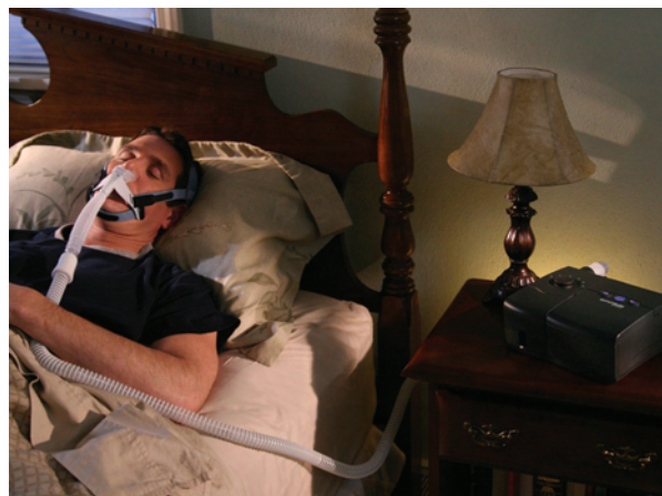
CPAP therapy is safe and effective.

For more information about sleep apnea, talk to your healthcare provider or visit sleepapnea.com